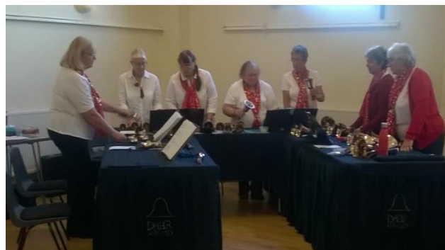
Dean Handbell Ringers