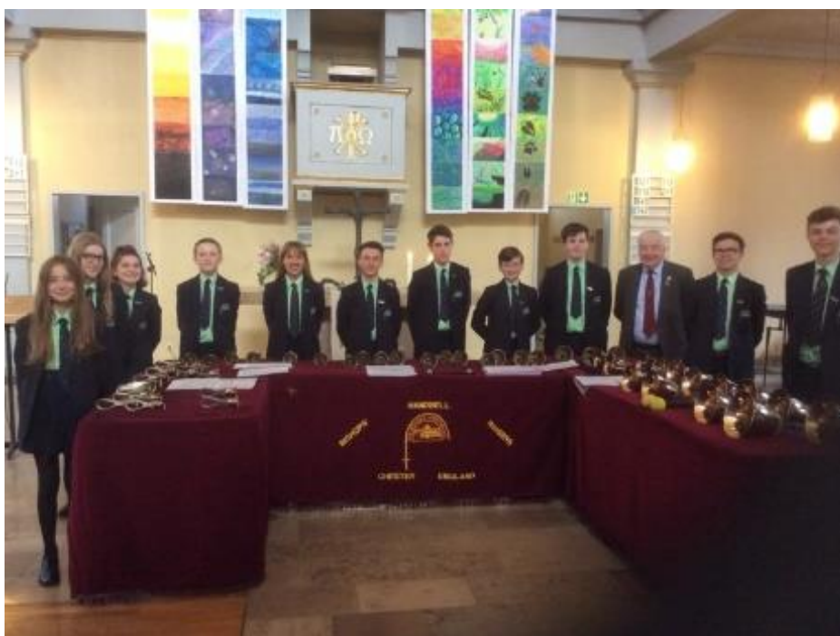
Bishops' Handbell Ringers at the Sunday Service