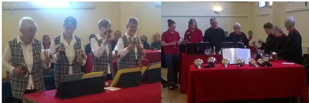
Kinder Quartet and Kirkby Lonsdale teams