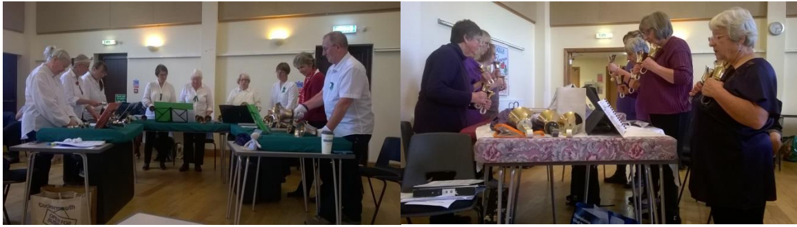
Marron Valley and Appleby teams