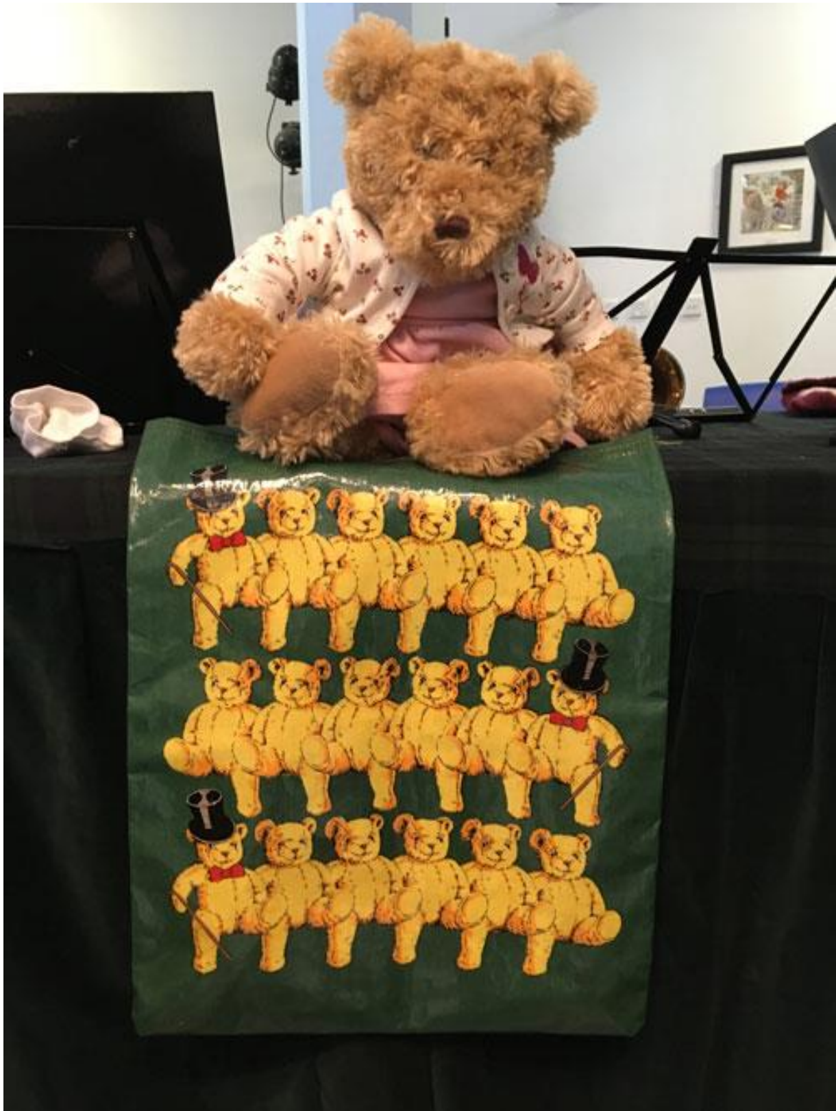
Northwest Spring Rally at Bury 2019