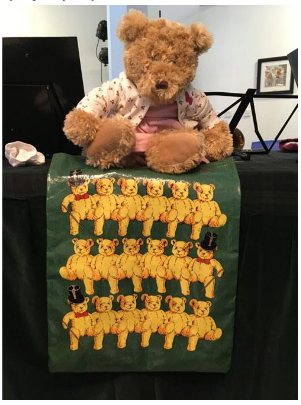
Northwest Spring Rally at Bury 2019